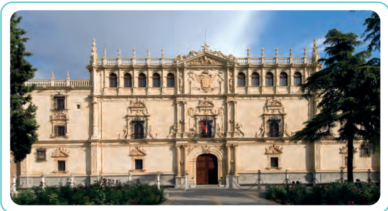
UNESCO World Heritage University and historical site of Alcalá de Henares

Universidad de Alcalá (UAH) Plaza San Diego, s/n 28801 Alcalá de Henares (Madrid)